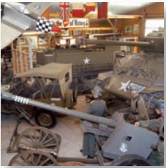
Call for pricing

After enjoying a continental breakfast at your hotel, visit the Indiana Military Museum, featuring the most outstanding display of vintage vehicles, weaponry, and other memorabilia from the Civil War, WWI, WWII, Vietnam War, and Desert Storm to the present.